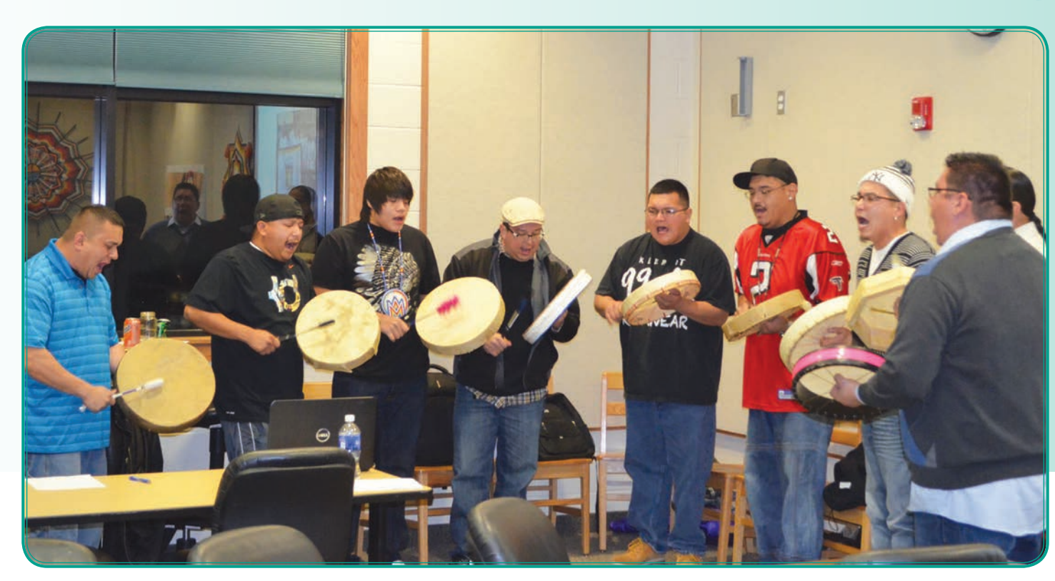
1st Annual Gaawitaasiban Hand Drum Contest