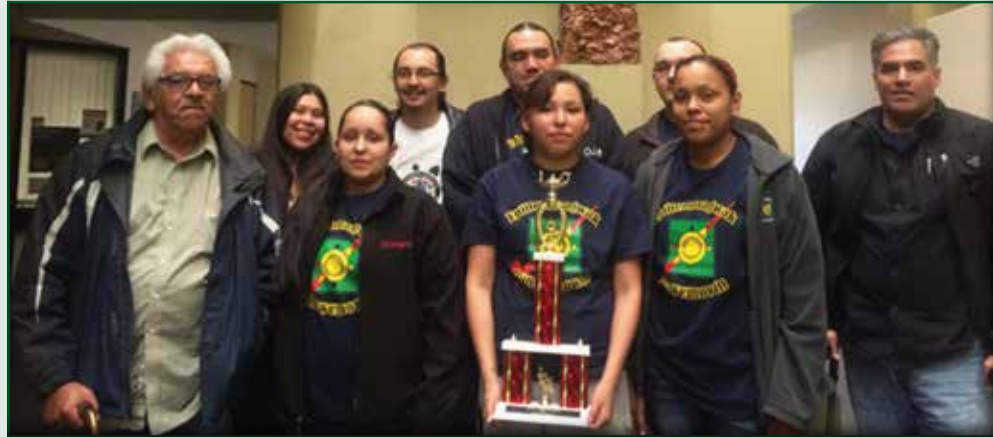
Men & Women's Team